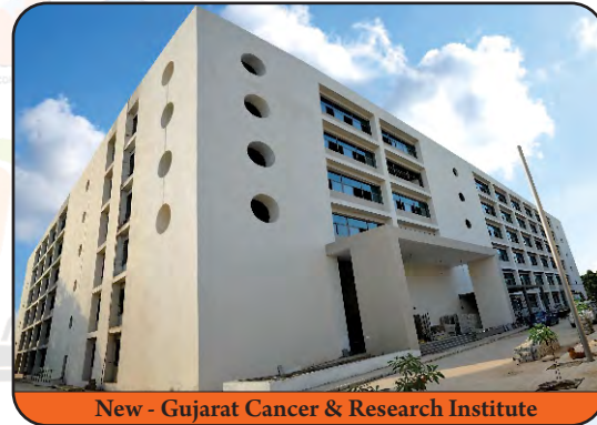
New - Gujarat Cancer & Research Institute