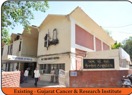
Existing - Gujarat Cancer & Research Institute